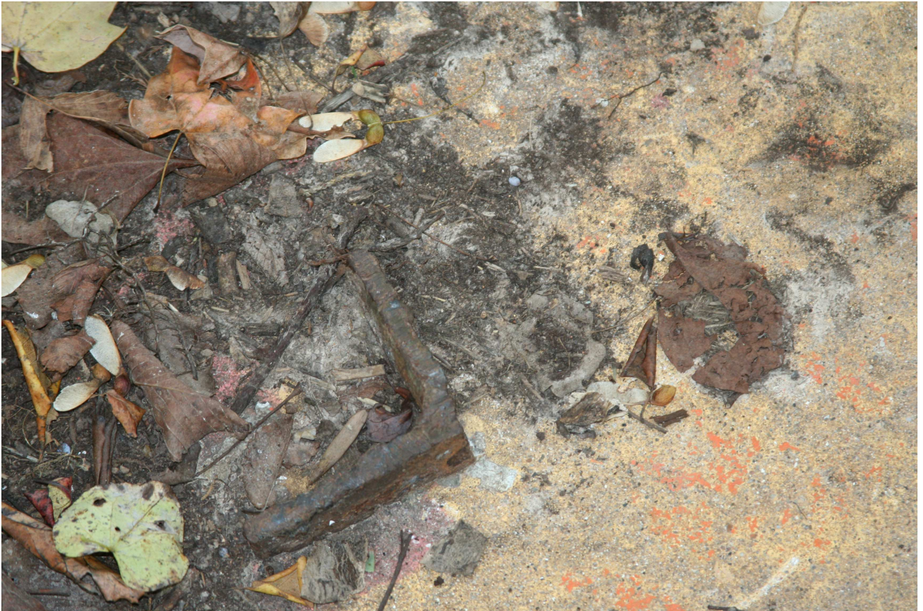
Remains of southwest tower leg.