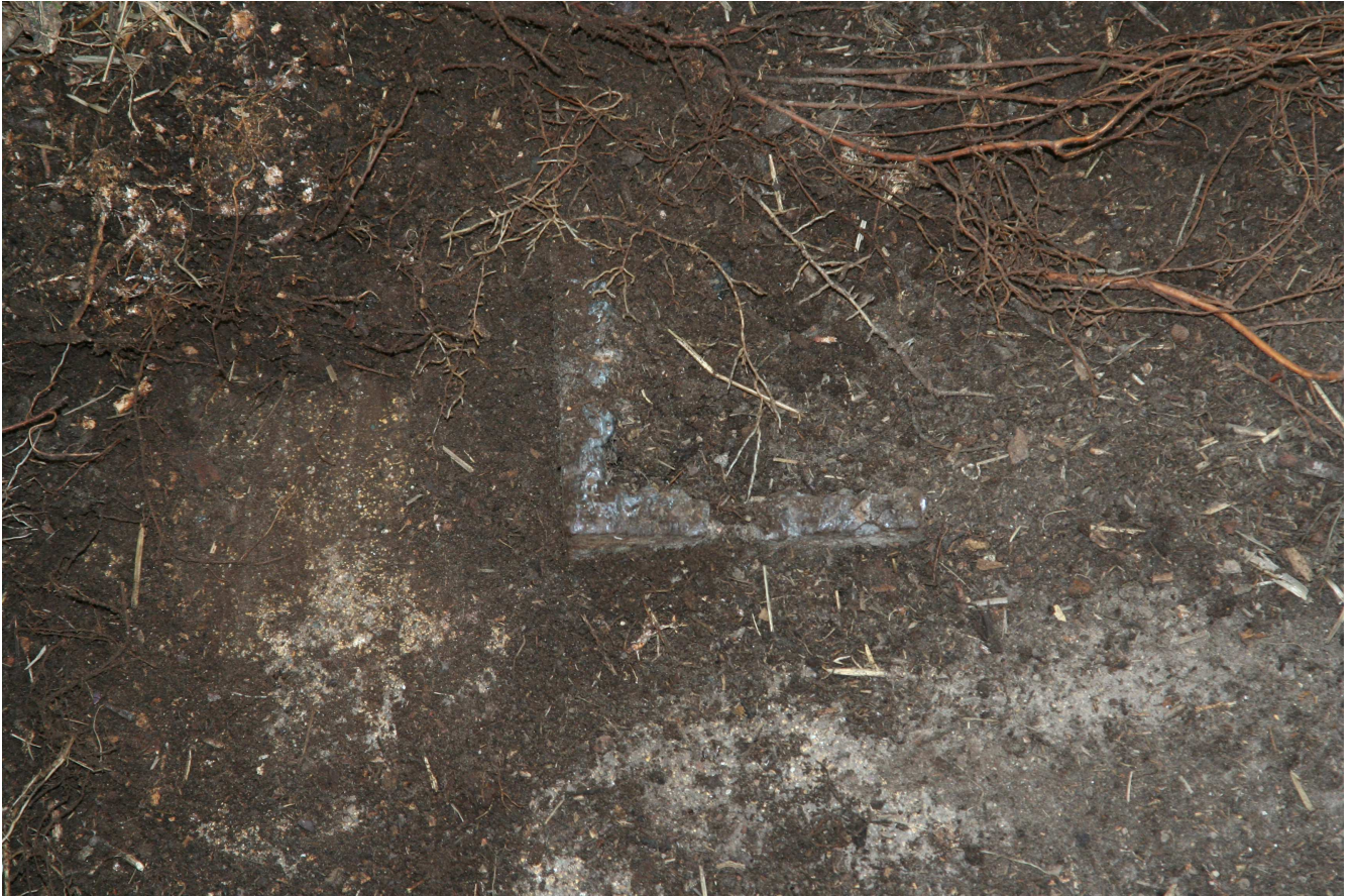
Northwest tower stub.