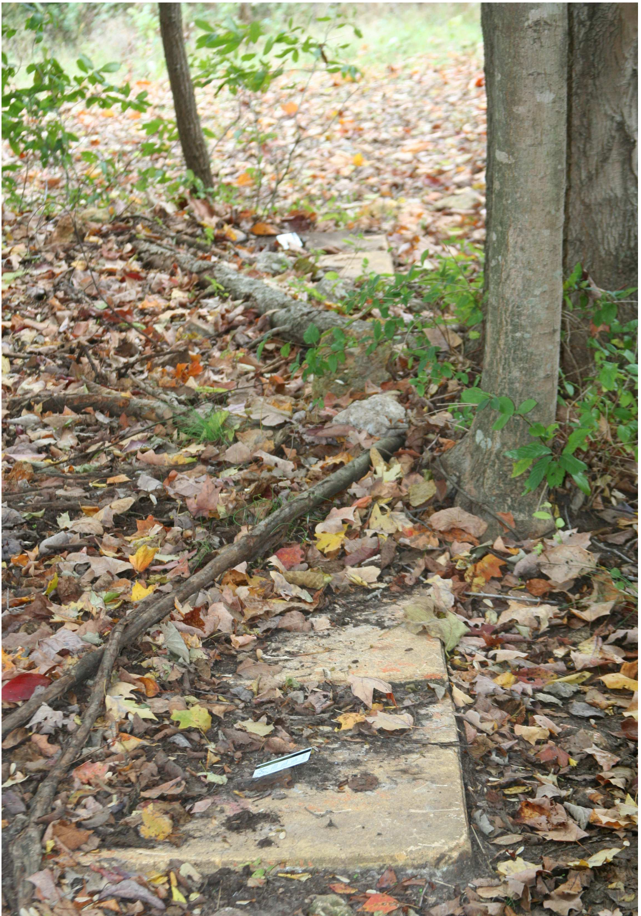
View along the southerly edge of slab, camera pointing in the direction of 120 degrees, the southeast and southwest stubs are marked with white cards.