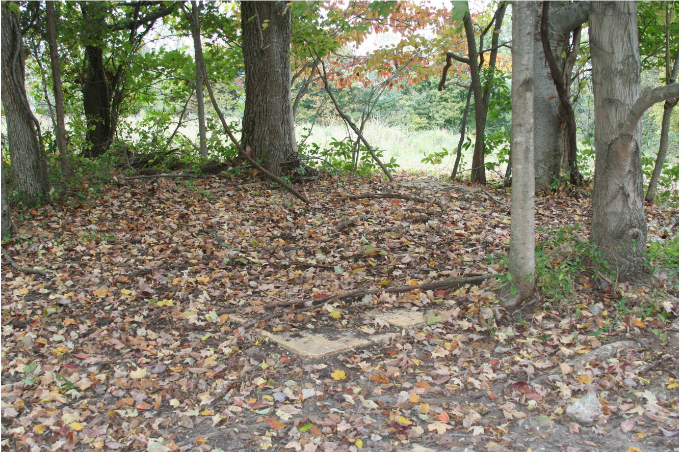
Southwest corner of the Beacon 70 foundation slab. Clump of trees in the left background may have been the location of a generator shack if one was installed. Since the site was adjacent to a county road power was likely from a commercial line.